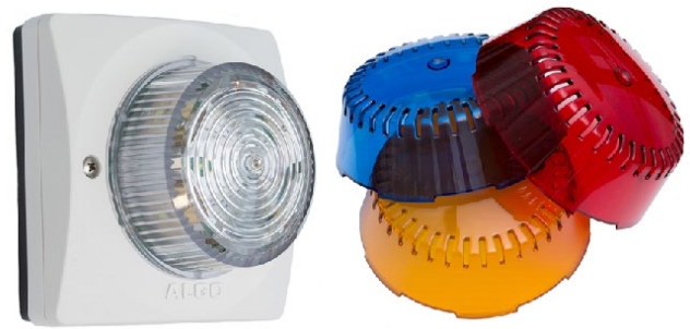
FrontRow Part # 6400-00012

Connect the Strobe to DC power and trigger using a contact closure relay on the FrontRow CM800 or CM800Si.